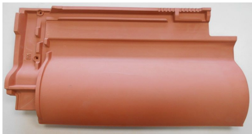
Piece without water repellent treatment

Construction details where the material named in this technical form have been placed: (For the final qualification, this technical form shall be stamped and signed by the manufacturer)